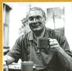
Thank you for your ongoing support to our ministry Pg. 2