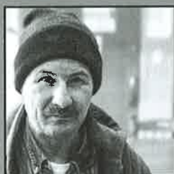
During the holiday season the poor and the needy need to know how much you care