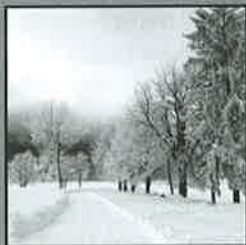
The Loneliest Time of the Year