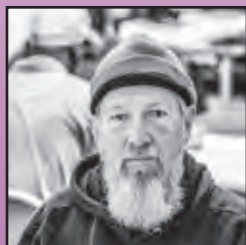
The Easter season holds great promise for those in need . . .